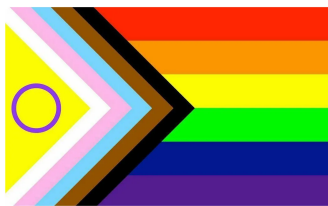
Inclusive Pride Flag Celebrates the diversity of the LGBTQ+ community