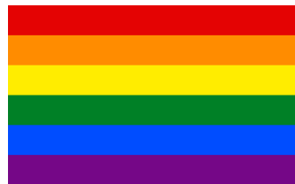
Pride Flag Generalized to Men who love Men and Women who love Women