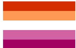
Lesbian Pride Flag Women who love Women