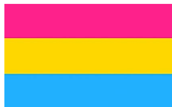
Pansexual Pride Flag People who love others based off of their personality rather than biological sex or gender