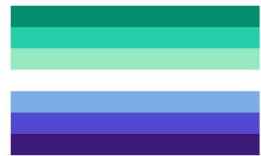
Gay Pride Flag Men who love Men