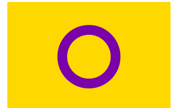
Intersex Pride Flag Person born with ambiguous genitalia

Don't assume someone's identity based on their presentation.