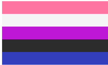
Genderfluid Pride Flag People who don't don't identify with a fixed gender