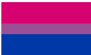
Bisexual Pride Flag People who love both Men and Women