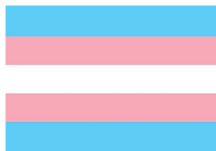
Trans Pride Flag Anatomical Sex does not match with Gender expression or identity