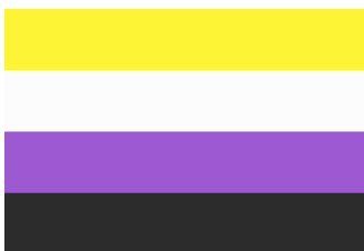
Nonbinary Pride Flag Person who neither identifies as male or female