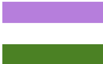
Genderqueer Pride Flag People who do not identify with conventional gender identities; identify with neither or a combination of male and female genders